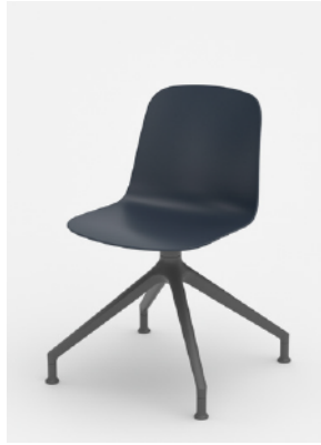
Oceano S 7020-R90B