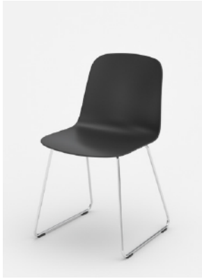
Carbone S 9000-N