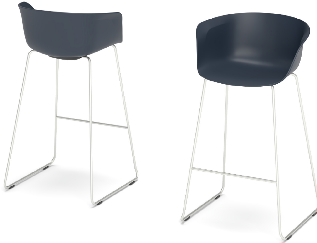
Sled base Chromed steel