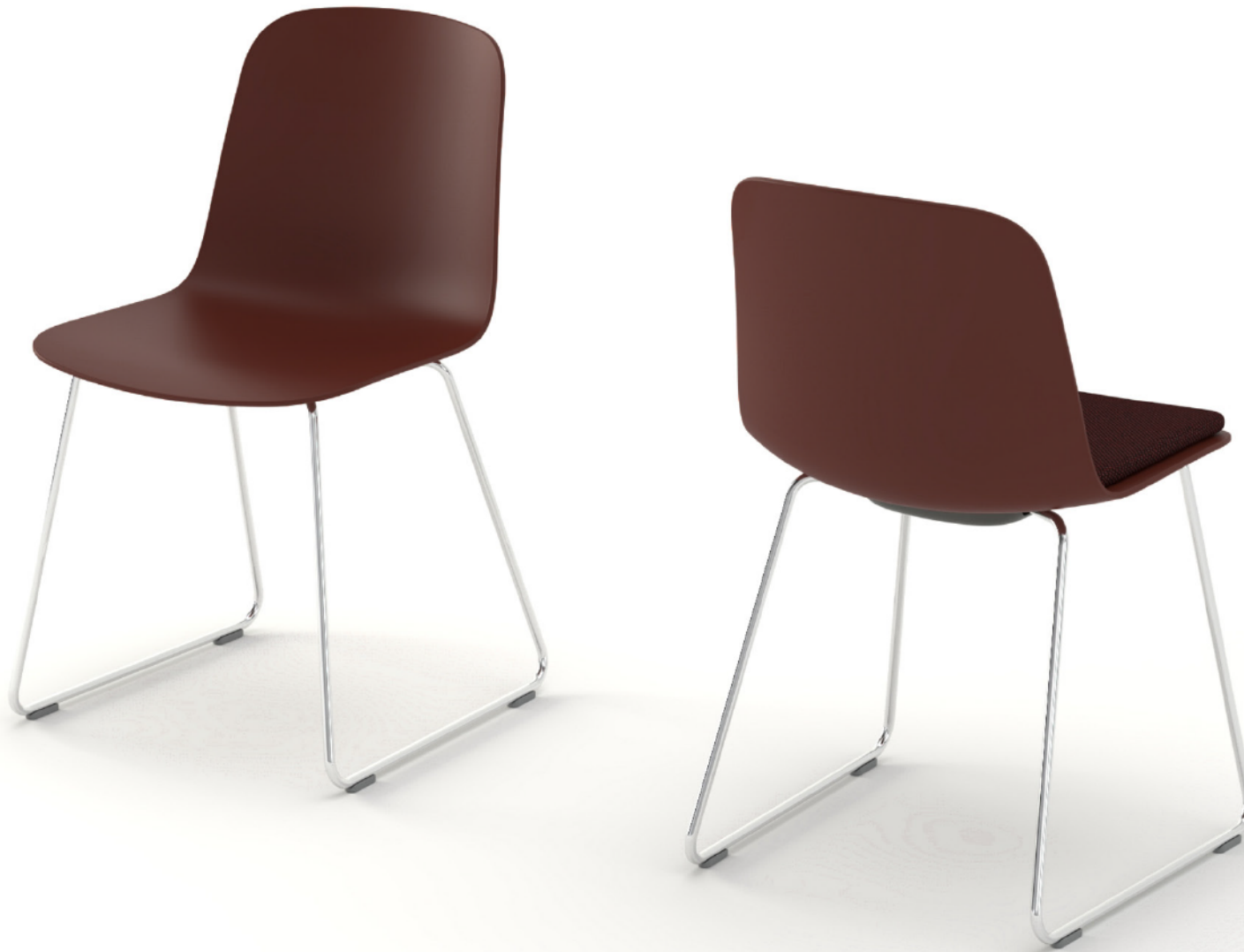
Non-stacking Sled base Chromed steel