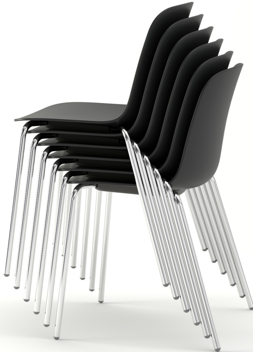
Stacking base Chromed steel