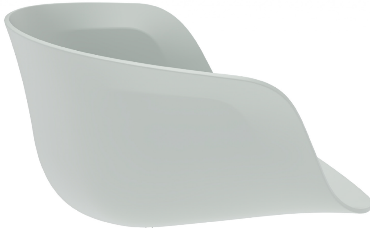
Bar Stool Shell Polypropylen