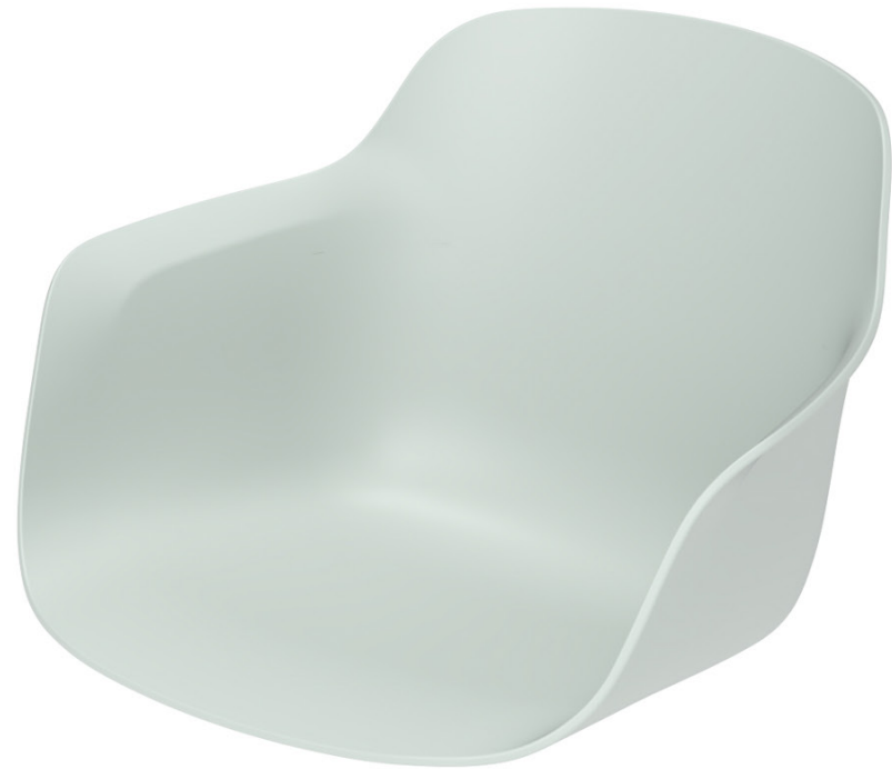
Chair and Armchair shells Polypropylen