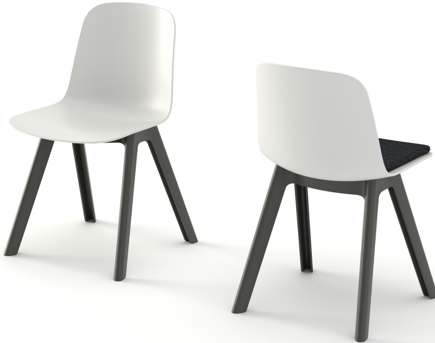
4-legged non-stacking base Polypropylen