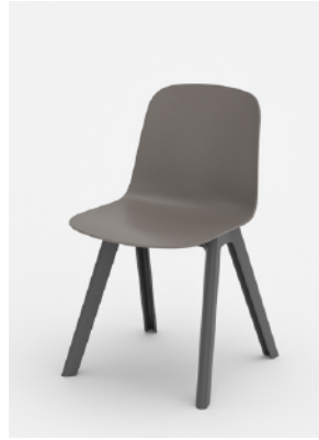
Warm Grey S 6005-Y20R