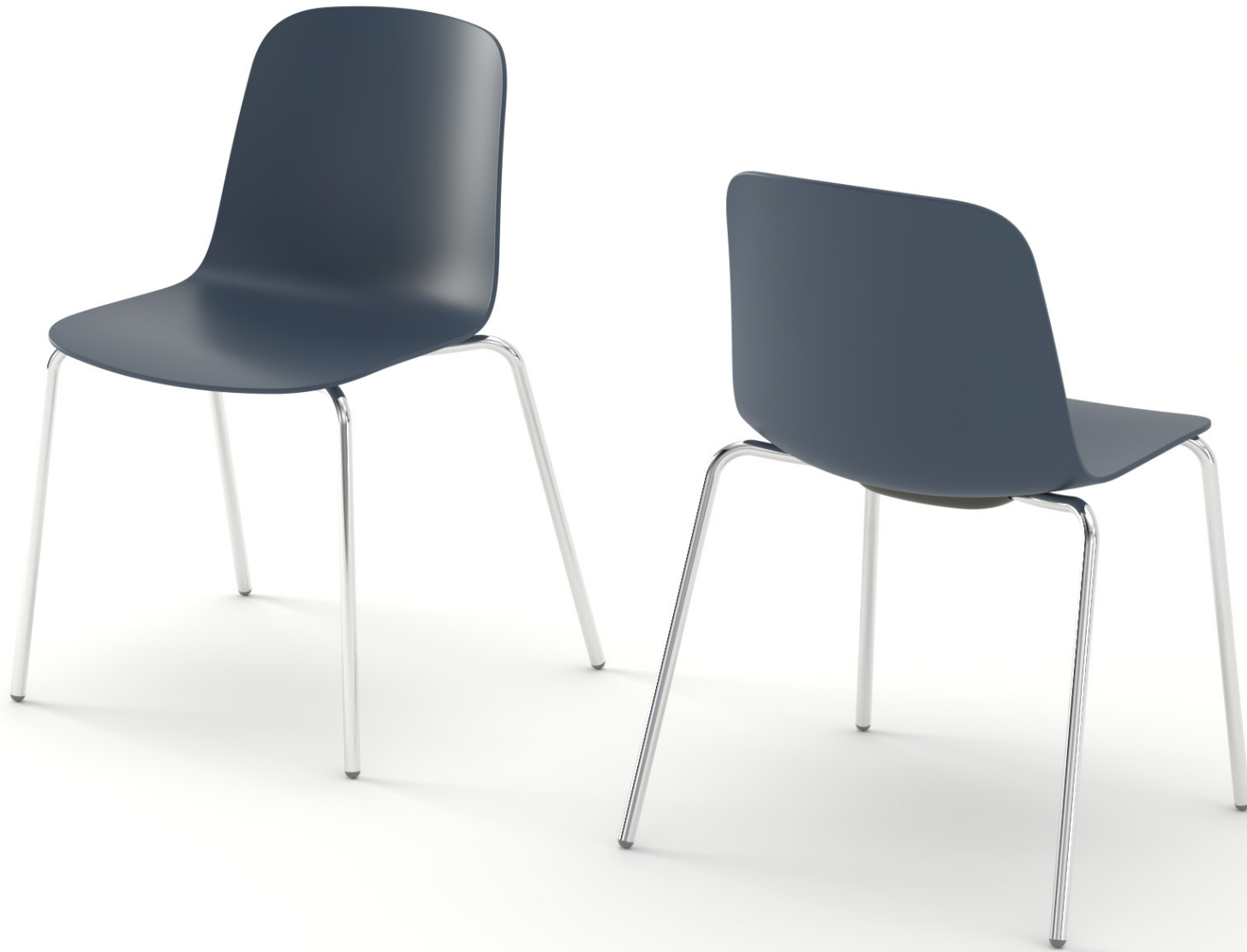
Stacking base Chromed steel