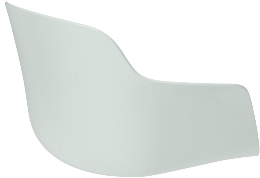
Chair and Armchair shells Polypropylen