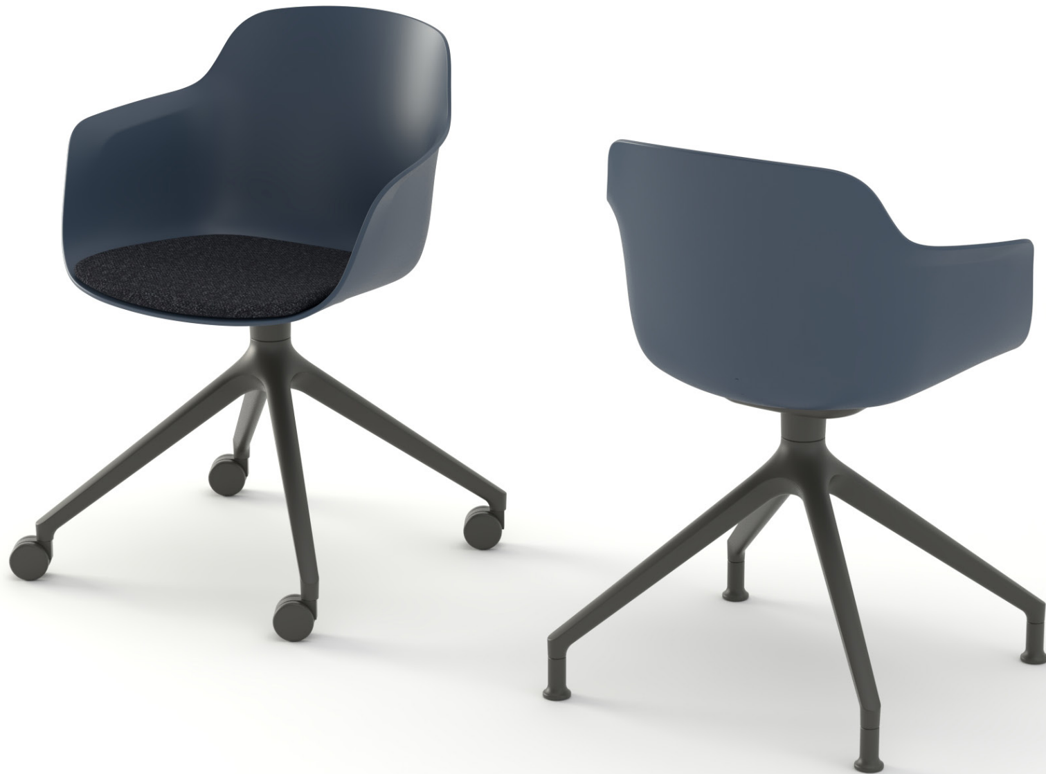
4-star swivel base Polyamid