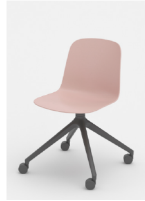
Rose Quartz S 1515-Y90R