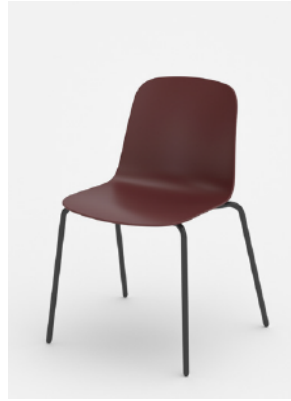
Vino S 5540-Y90R