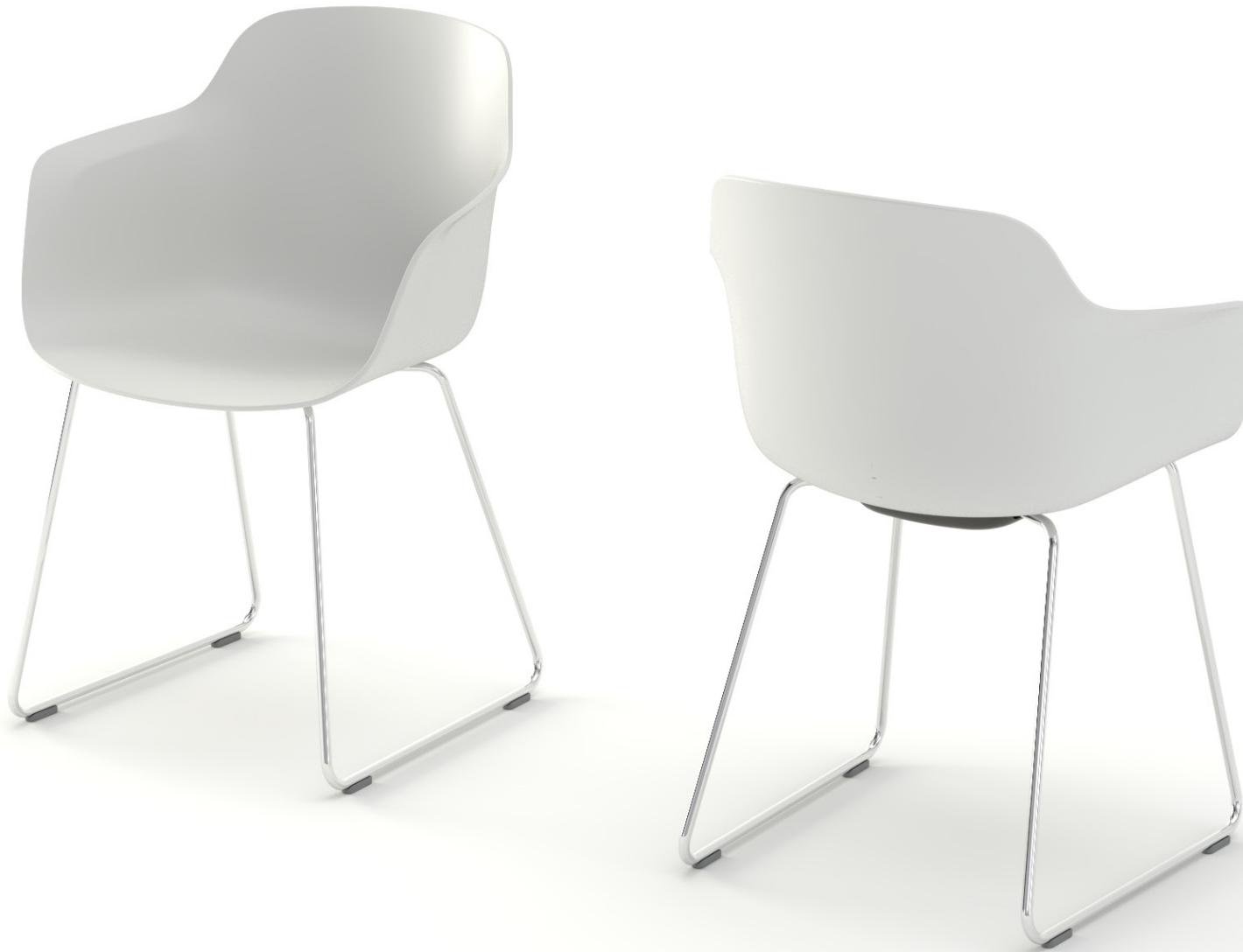
Non-stacking Sled base Chromed steel