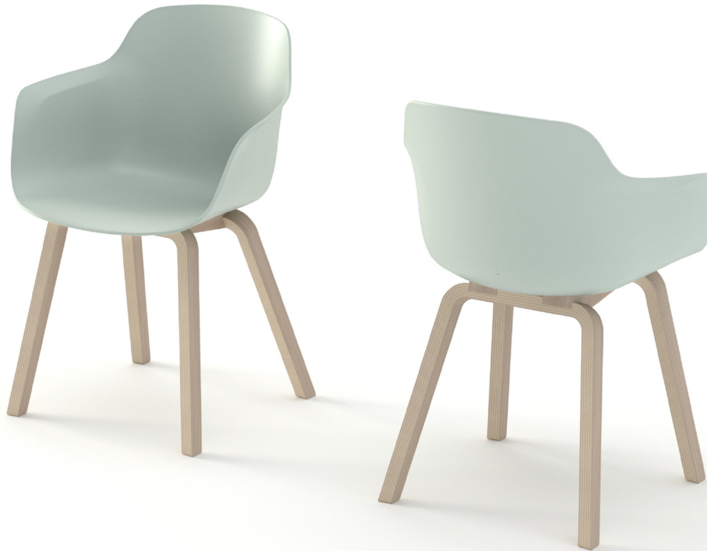
Wooden base Plywood