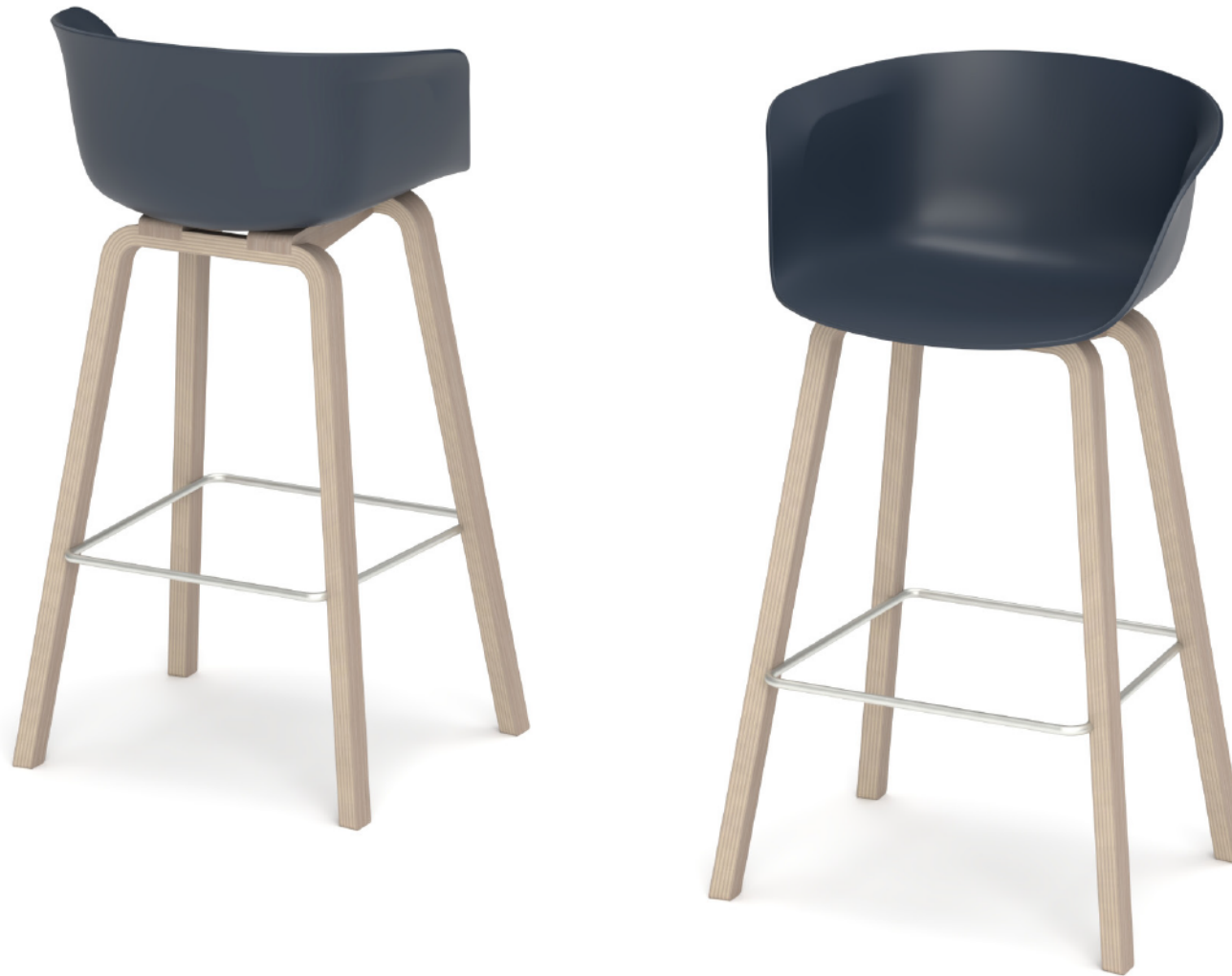
Wooden base Plywood