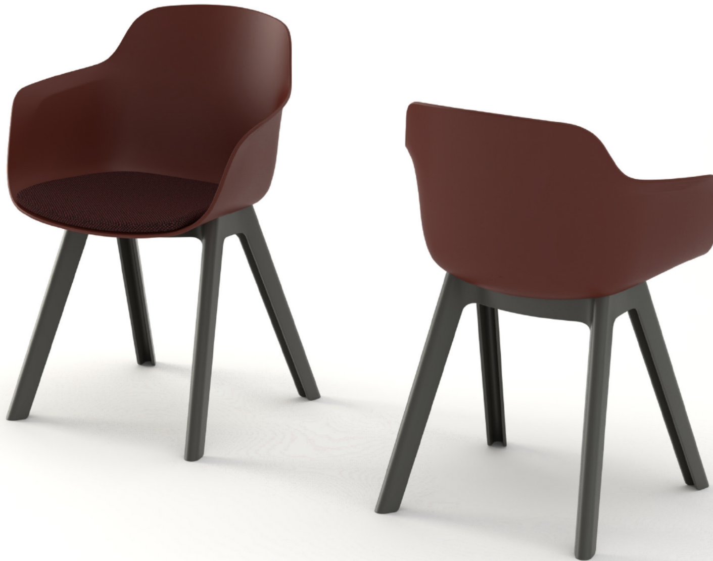
4-legged non-stacking base Polypropylen