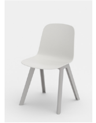
Gesso S 1000N