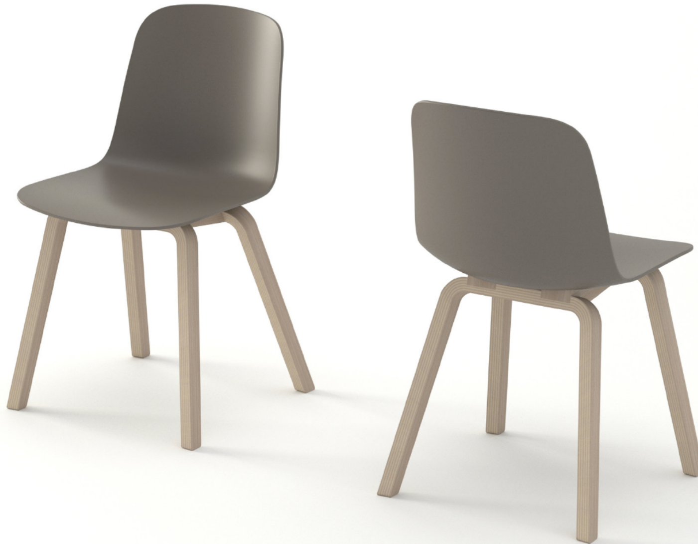
Wooden base Plywood