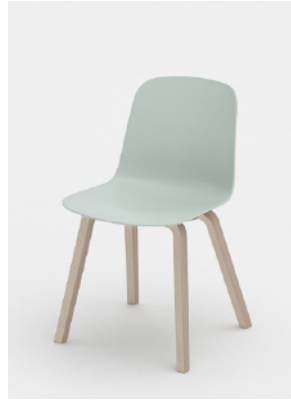
Torrente S 3005-G50Y